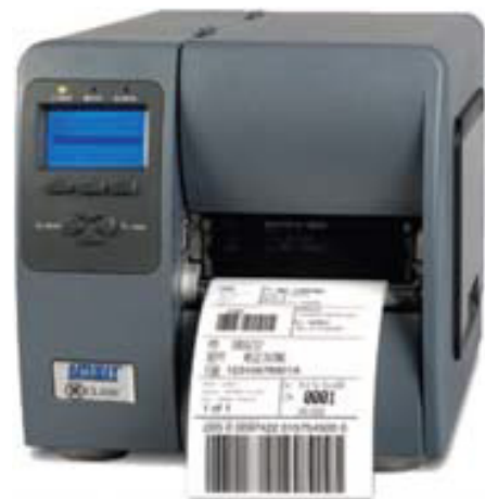
Ticket Barcode/RFID Printer

Identify and eliminate abuse of contracted operators.