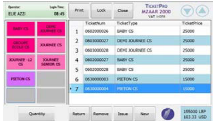
POS MAIN SCREEN

We, at CHIP, understand our customers' demands for a risk-free investment and a wise system that will serve them with exceptional performance now and well into the future. With TicketPro the return on investment is guaranteed and most of all the satisfaction of the clients and the possibility to centrally manage multiple sites will help you expand your business and increase your profitability.