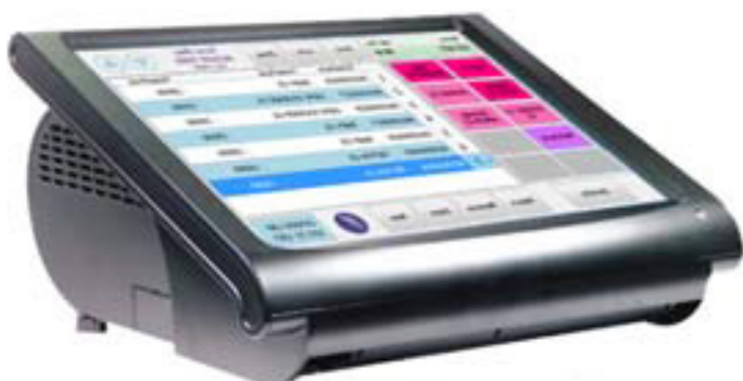
Desktop POS Terminals